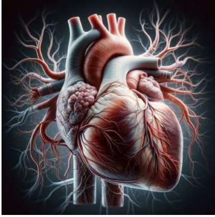
Figure 1: First Image